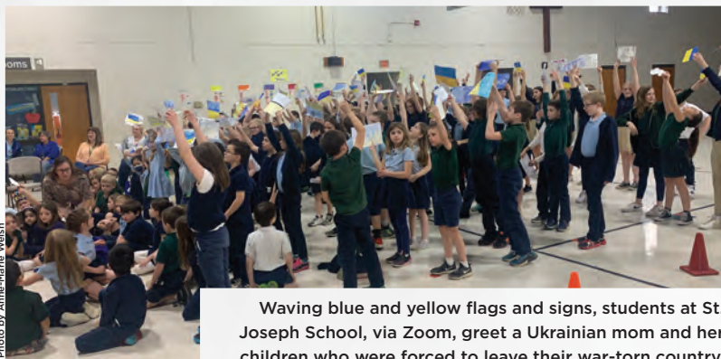
Waving blue and yellow flags and signs, students at St. Joseph School, via Zoom, greet a Ukrainian mom and her children who were forced to leave their war-torn country.

“It is a long distance between us, but because we care for everybody, that love makes it a lot shorter.”