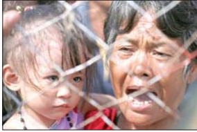
A woman and child wait to be airlifted to Manila at Taoblan airport in aftermath of Typhoon Haiyan.

Philippine President Benigno Aquino said Nov. 13 he expected the death toll to be around 2,500—lower than initially predicted.