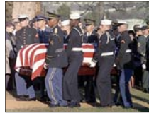
U.S. servicemen carry the casket of slain President John F. Kennedy on Nov. 25, 1963.

"My heart has been so filled with grief over the tragedy our nation is enduring. I have been forced to sit silently in my study and resort to prayer and meditation. However, I cannot let the event pass by without joining you in your profound sympathy and your prayers that God will lead us safely through this painful experience."