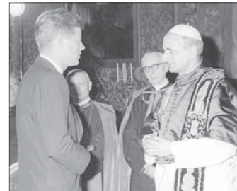
President John F. Kennedy meets Pope Paul VI at the Vatican in an undated photo.

He was the first Catholic president of the United States. We recall our pleasure in receiving his visit and having discerned in him great wisdom and high resolution for the good of humanity."