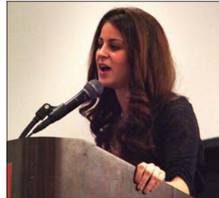
Lila Rose, founder of the pro-life group Live Action, which currently focuses on investigating Planned Parenthood programs, was the keynote speaker at People for Life's 34th annual Pro-Life Prayer Breakfast Jan. 7 in Erie.

"I believe that this is the greatest movement that any of us can be a part of because it's a movement that celebrates the greatest gift that we've