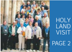
HOLY LAND VISIT PAGE 2