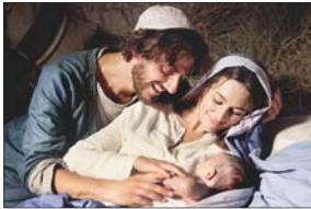
Luca Marinelli portrays Joseph and Alissa Jung as Mary in a scene from the movie "Mary of Nazareth."

"The first two days [of filming] I was a bit shocked. Then I calmed myself down and said, 'First of all, you are interested in the human being, you are not interested in being an icon,'" Jung told The Colorado Catholic Herald , newspaper of the Diocese of Colorado Springs.