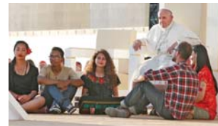
World Youth Day pilgrims sit in front of Pope Francis as he leads a prayer vigil in Poland last July.

Pope Francis chose "Young people, faith and vocational discern-