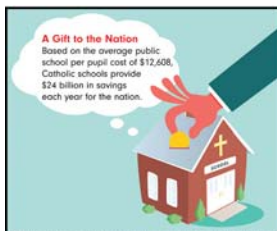
Source: U.S. Catholic Elementary and Secondary Schools (2013-2014). The Annual Statistical Report on Schools, Enrollment and Staffing (NSAS).