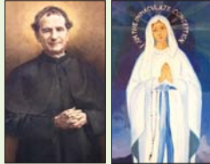
St. John Bosco