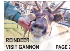
REINDEER VISIT GANNON PAGE 2