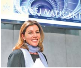
Barbara Jatta, the new director of the Vatican Museums, leaves a Jan. 23 Vatican news conference at which the revamped, mobile-compatible website for the Vatican Museums was unveiled.

VATICAN CITY (CNS)—In an effort to share its masterpieces with even more people around the world, the Vatican Museums has established a YouTube channel and revamped its website to offer high-resolution images and mobile-friendly information.