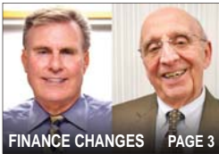
FINANCE CHANGES PAGE 3

■ As of Feb. 13, the diocese will have: • 116 active priests • 45 retired priests