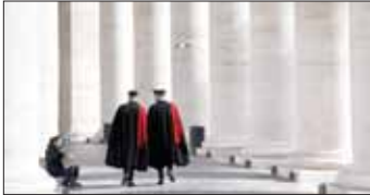
Members of the Carabinieri, the Italian military police force, patrol around St. Peter's Square at the Vatican Feb. 21.

When Pope Benedict XVI officially left office Feb. 28, most of the top-level Vatican officials lost their jobs, but that does not mean the majority of Vatican employees get a vacation. Although Catholics inside and outside the Vatican love to complain about its unwieldy bureaucracy, coordinating the universal ministry of the church involves a steady flow of paperwork, correspondence and meeting planning. All of that continues even when there is no pope. However, the publication of documents, the nomination of new bishops and the approval of statutes for Catholic universities and religious orders are suspended. Anything that must be issued in the name of the Vatican or in the name of the pope must be approved by Pope Benedict's successor. "The general rule is that all ordinary business continues," the secretary of one Vatican congregation said during the "interregnum" — the period between popes — in 2005. "Like in most bureaucracies, most of our business is ordinary business." Commissions and subcommittees continue to meet, reports continue to be prepared, letters are answered and Vatican officials try to tidy their desks enough to be able to inform the new pope about exactly where their various projects stand.