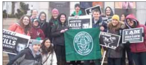
Mercyhurst University's Lakers for Life led the Jan. 12 Erie March for Life.