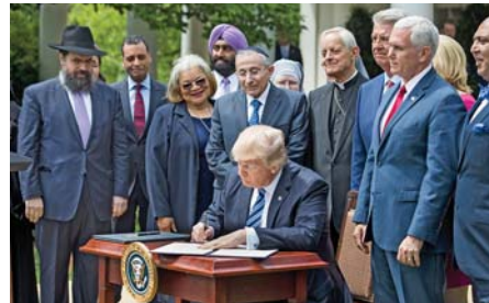
President Donald Trump signs his executive order on religious liberty during a National Day of Prayer event at the White House in Washington May 4. In the background, center, is Cardinal Donald Wuerl of Washington, D.C.