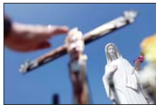
A woman touches a cross at a venerated site in Medjugorje, Bosnia-Herzegovina.

the Interpretation of Legislative Texts; and Archbishop Angelo Amato, prefect of the Congregation for Saints' Causes and former secretary of the doctrinal congregation.