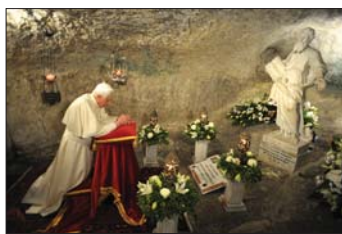
Pope Benedict XVI prays inside St. Paul's Grotto in Rabat, outside Valletta, Malta, April 17. It is believed that St. Paul lived at the grotto site during the three months he and his companions were shipwrecked on the island.