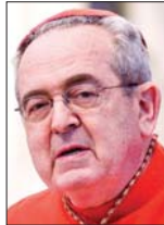
Cardinal Justin Rigali

And with deep fraternal affection, we say "ad multos annos" but also praise to you Lord Jesus Christ, high priest and eternal shepherd of the flock.