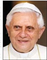
Pope Benedict XVI