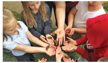
In this contributed file photo, students at Immaculate Conception School in Clarion put into action Pope Francis' message to care for the earth and all of its creatures.

Endorsed by Pope Francis, and signed by 195 nations, the Paris pact aims to cut global greenhouse