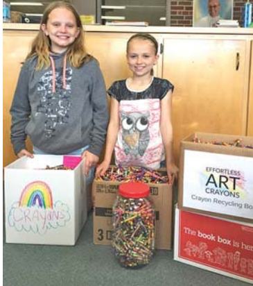
ERIE—Students at Blessed Sacrament School in Erie recently donated used crayons for recycling to Two Sparrows Learning System. Two Sparrows recycles used crayons to make "effortless art crayons," an adaptive crayon for special needs children.