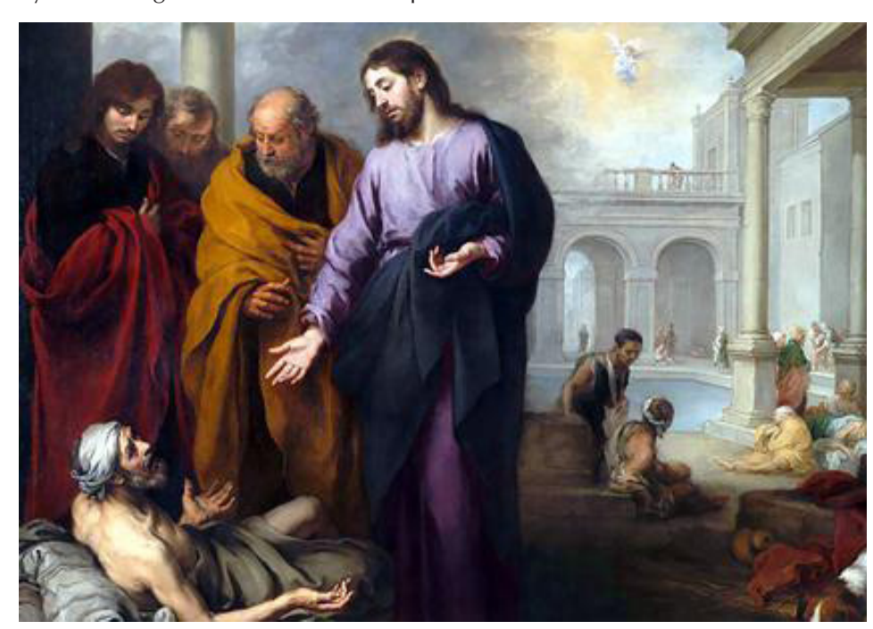
Compassion is the doorway to a more responsive stewardship and a committed discipleship.

January is traditionally the time for new beginnings, fresh starts. For the Christian steward, the grace of being given another day, or God willing, a whole new year, stirs our deep gratitude. But it also calls us to ask what a "resolution" should really be. Our first resolve should always be to involve ourselves more intimately in the life of Christ, and how better to do that than by embracing Christ's call to be compassionate?