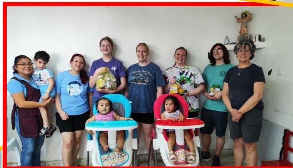
Students from Mercyhurst University, Erie