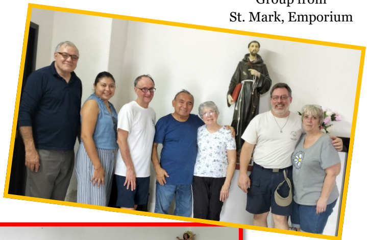
Group from St. Mark, Emporium

Many Thanks to the Erie Seminarians and the seminary Priests!