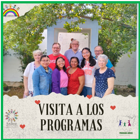
Group from St. Mark, Emporium