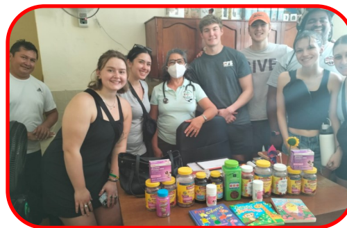
Students from Gannon University, Erie