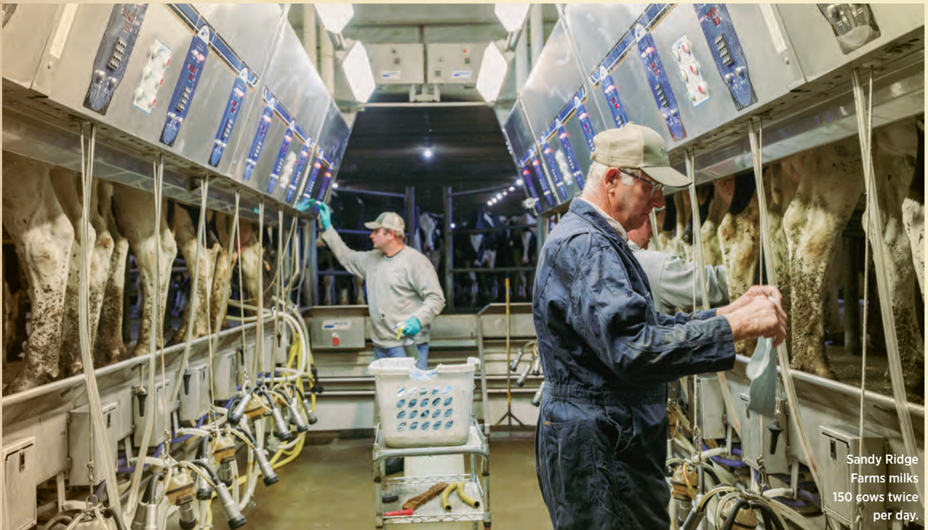
Sandy Ridge Farms milks 150 cows twice per day.